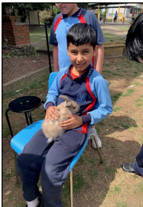
He can't bite us now because he is locked